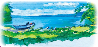
Himemasu (Kokanee Salmon) Fishway

The historic architecture and the hatchery of Lake Towada himemasu (kokanee salmon) on Lake Towada's western shores give you a feel for modern history and local tradition. Find a humble chapel along the walking path and appreciate the magnificent cedar construction of Towada Hotel.