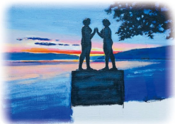
Statue of Maidens

This area is home to the famous Statue of Maidens and Towada-jinja Shrine. The center of sightseeing at Lake Towada, Yasumiya has plenty of restaurants, gift shops, lodgings, boats, and canoes as well as a visitor center and tourist information center.