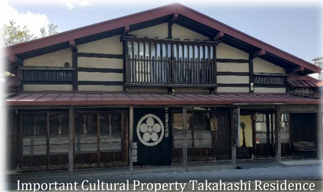
Important Cultural Property Takahashi Residence