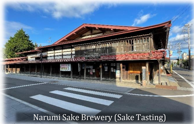
Narumi Sake Brewery (Sake Tasting)