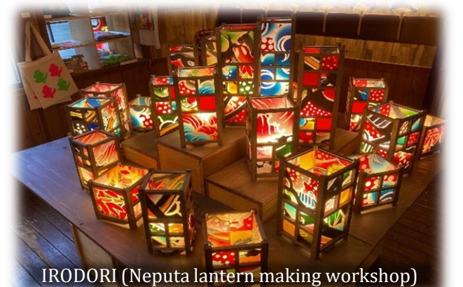
IRODORI (Neputa lantern making workshop)

And there's so much more to see at Nakamachi Komise Street!