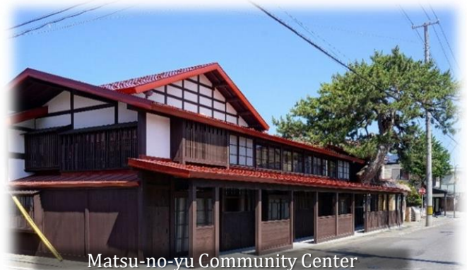
Matsu-no-yu Community Center