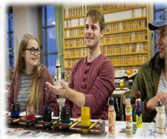
Kokeshi Painting Workshop