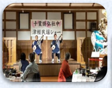
Tsugaru Folk Song Performances