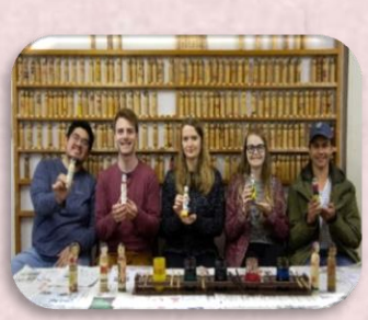
Kokeshi Painting Workshops