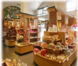
Souvenir Shop (Tsugaru Traditional Craft Center)