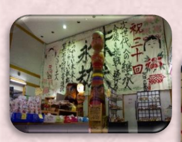
Largest Kokeshi in Japan