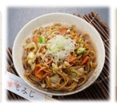
Kuroishi Yakisoba Soup