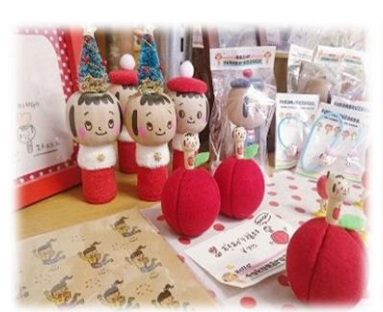
Souvenir Shop (Tsugaru Kokeshi Museum)