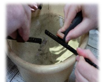
Tsugaru Lacquerware Workshop