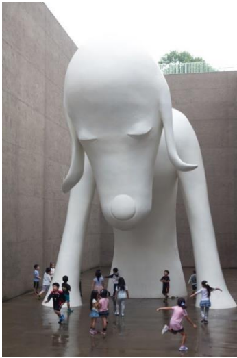
Nara Yoshitomo, Aomori-ken (Aomori Dog) 2005