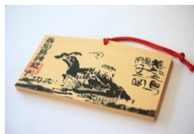
Wish Plaque (Ema)