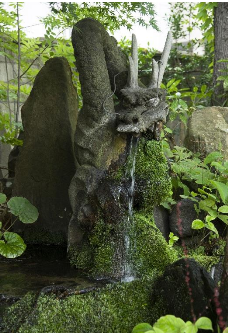
“Ryuji”, the God of Sea and Water