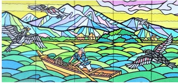
“Nebuta paintings stained glass style: Morning of Uto village” Viewable at Aomori Prefectural Center for Industry and Tourism, ASPAM 13 th Floor

Many fishermen would use the lush and verdant pine forest that lied to the right of the foot of Mt. Hakkoda as a landmark to navigate to the village port. Later, the Tsugaru Clan would rename Uto to “Aomori (Green Forest).”