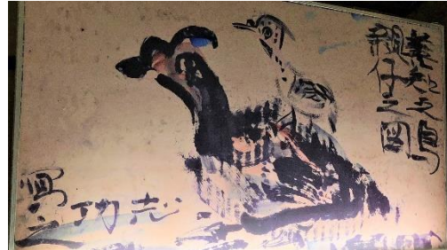
Painting of Mother and Child Uto Birds