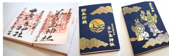
Shrine Stamp Book (Goshuin-cho)