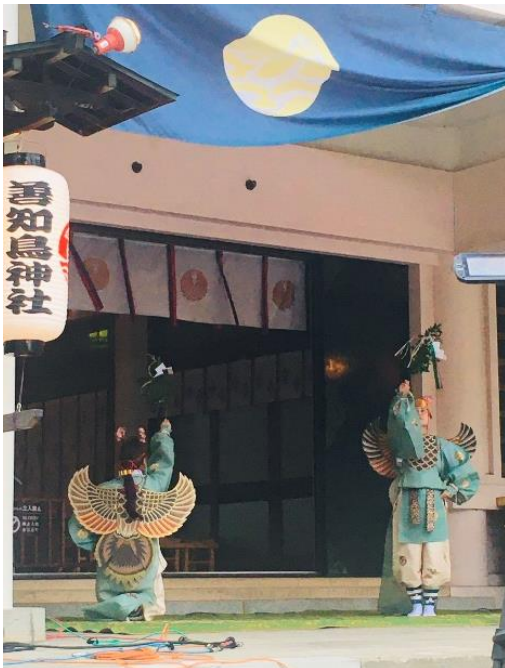
Sacred Ritual Performance “Utomai” (only performed on specific days)