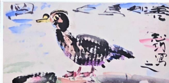
Painting of an Uto Bird (the Shrine’s Namesake)