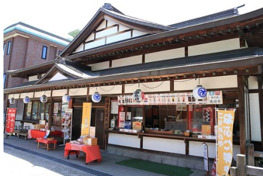
Shrine Shop 9:00AM–5:00PM